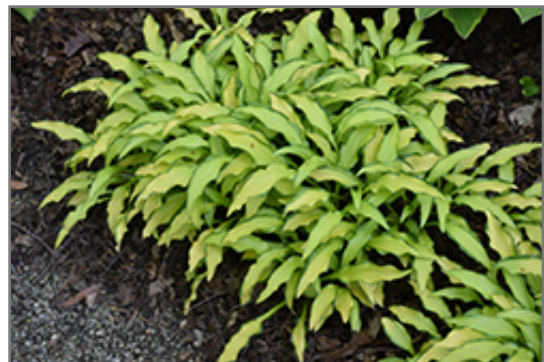
Kabitan Hosta