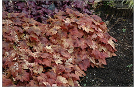
Sweet Tea Foamy Bells