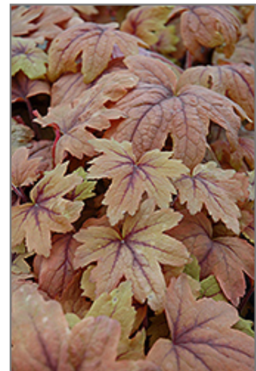
Sweet Tea Foamy Bells foliage