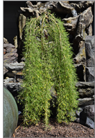
Walker Weeping Peashrub