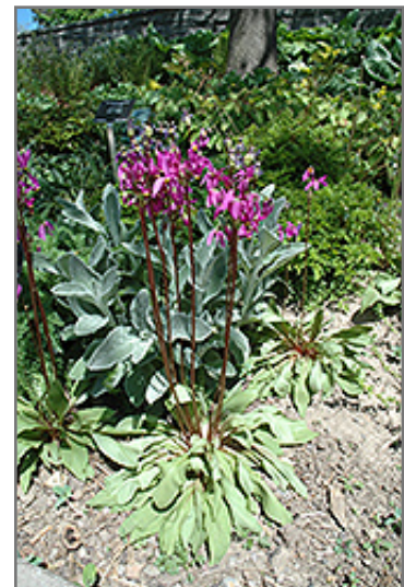
Aphrodite Shooting Star in bloom