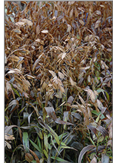
Northern Sea Oats in fall

This is a relatively low maintenance plant, and is best cleaned up in early spring before it resumes active growth for the season. It has no significant negative characteristics.