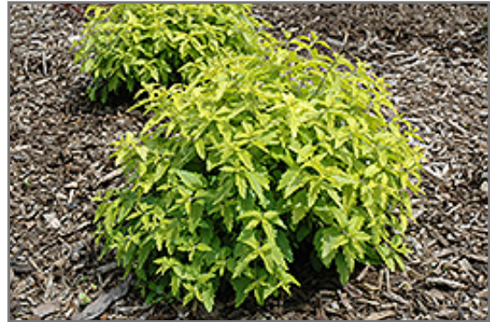
Sunshine Blue Caryopteris

Sunshine Blue Caryopteris is recommended for the following landscape applications;