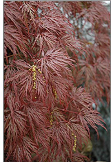
Inaba Shidare Cutleaf Japanese Maple foliage

This is a relatively low maintenance tree, and should only be pruned in summer after the leaves have fully developed, as it may 'bleed' sap if pruned in late winter or early spring. It has no significant negative characteristics.