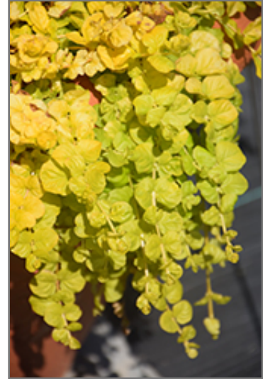
Goldilocks Creeping Jenny foliage

Goldilocks Creeping Jenny is a dense spreading perennial with a ground-hugging habit of growth. Its relatively fine texture sets it apart from other garden plants with less refined foliage.