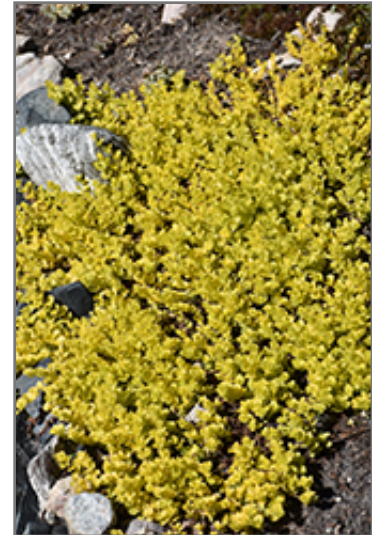
Goldilocks Creeping Jenny

Call on how 1390 Windmill Lane Ottawa, Ontario, Canada K1B 4V5 Toll Free: +1 800 267 1922 Telephone: +1 613 741 4430