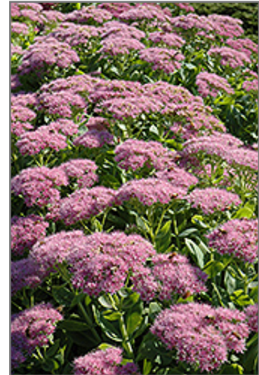
Brilliant Stonecrop flowers

This is a relatively low maintenance plant, and is best cleaned up in early spring before it resumes active growth for the season. It is a good choice for attracting bees and butterflies to your yard, but is not particularly attractive to deer who tend to leave it alone in favor of tastier treats. It has no significant negative characteristics.