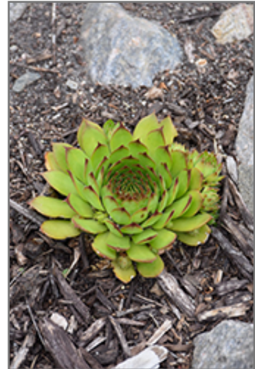
Sunset Hens And Chicks

Sunset Hens And Chicks is recommended for the following landscape applications;