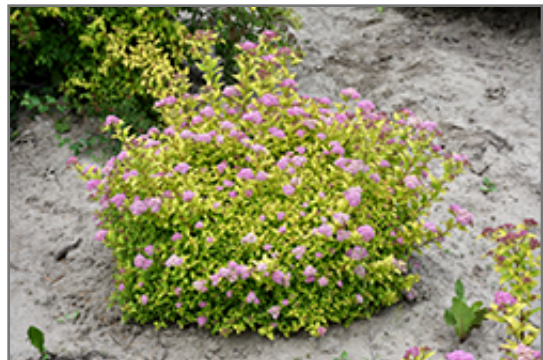
Sundrop Spirea in bloom