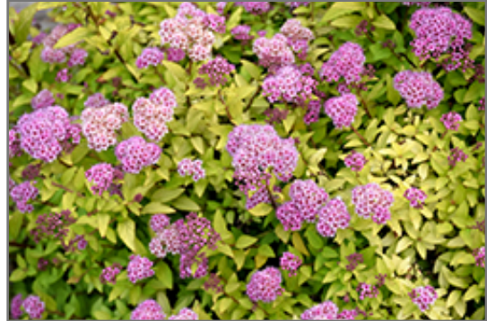
Sundrop Spirea flowers

This shrub will require occasional maintenance and upkeep, and is best pruned in late winter once the threat of extreme cold has passed. It is a good choice for attracting butterflies to your yard, but is not particularly attractive to deer who tend to leave it alone in favor of tastier treats. It has no significant negative characteristics.