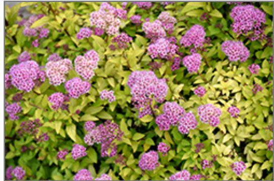
Sundrop Spirea flowers

This shrub will require occasional maintenance and upkeep, and is best pruned in late winter once the threat of extreme cold has passed. It is a good choice for attracting butterflies to your yard, but is not particularly attractive to deer who tend to leave it alone in favor of tastier treats. It has no significant negative characteristics.