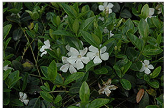
White Periwinkle flowers