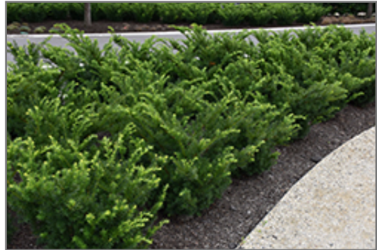
Densiformis Yew

Densiformis Yew is recommended for the following landscape applications;