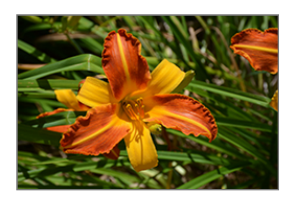
Frans Hals Daylily flowers

Brockville 3043 County Rd. 29 Brockville, Ontario, Canada K6V 5T4 Telephone: +1 613 341 9343