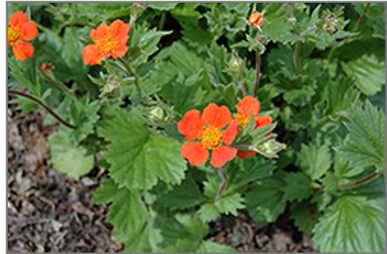
Boris Avens flowers

This is a relatively low maintenance plant, and should be cut back in late fall in preparation for winter. It is a good choice for attracting butterflies to your yard, but is not particularly attractive to deer who tend to leave it alone in favor of tastier treats. It has no significant negative characteristics.