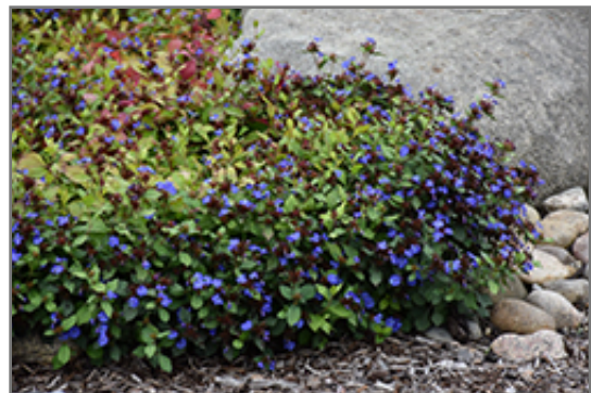
Plumbago in bloom