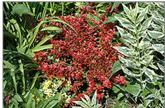
Cherry Bomb Japanese Barberry