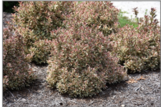
My Monet Weigela

My Monet Weigela will grow to be about 18 inches tall at maturity, with a spread of 18 inches. It tends to fill out right to the ground and therefore doesn't necessarily require facer plants in front. It grows at a medium rate, and under ideal conditions can be expected to live for approximately 30 years.