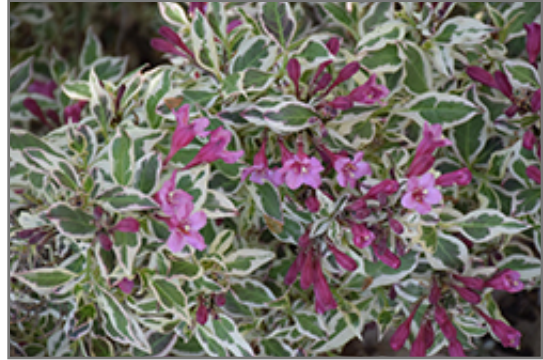
My Monet Weigela flowers

This shrub will require occasional maintenance and upkeep, and should only be pruned after flowering to avoid removing any of the current season's flowers. It is a good choice for attracting hummingbirds to your yard. It has no significant negative characteristics.