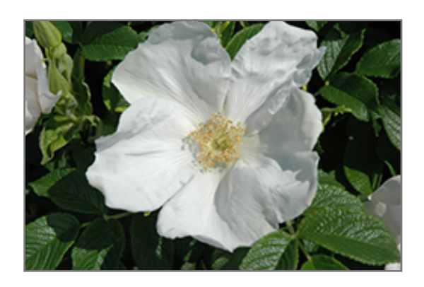
White Rugosa Rose flowers

Brockville 3043 County Rd. 29 Brockville, Ontario, Canada K6V 5T4 Telephone: +1 613 341 9343