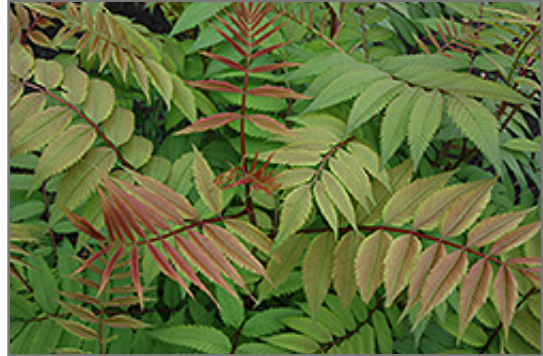
Sem False Spirea foliage

Sem False Spirea is a multi-stemmed deciduous shrub with a more or less rounded form. Its average texture blends into the landscape, but can be balanced by one or two finer or coarser trees or shrubs for an effective composition.