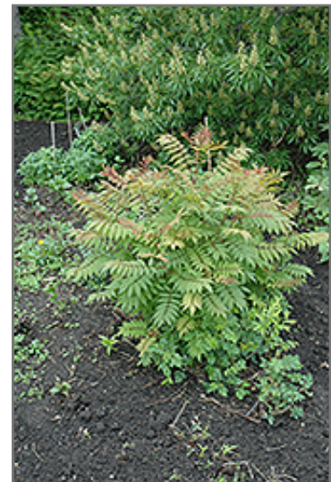
Sem False Spirea