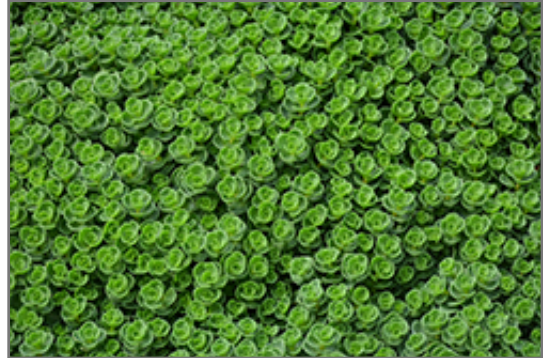
John Creech Stonecrop foliage

John Creech Stonecrop will grow to be only 3 inches tall at maturity, with a spread of 12 inches. When grown in masses or used as a bedding plant, individual plants should be spaced approximately 10 inches apart. Its foliage tends to remain low and dense right to the ground. It grows at a fast rate, and under ideal conditions can be expected to live for approximately 10 years. As an herbaceous perennial, this plant will usually die back to the crown each winter, and will regrow from the base each spring. Be careful not to disturb the crown in late winter when it may not be readily seen!