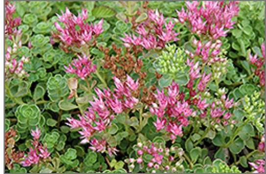
John Creech Stonecrop flowers

John Creech Stonecrop is recommended for the following landscape applications;