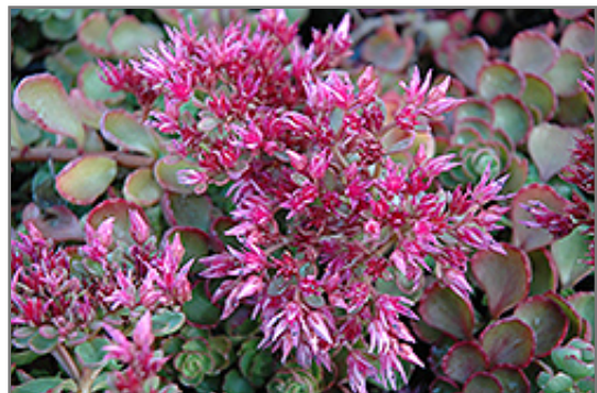
Fulda Glow Stonecrop flowers