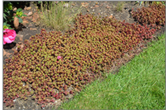
Fulda Glow Stonecrop