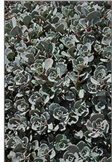
Lidakense Stonecrop foliage

Lidakense Stonecrop is recommended for the following landscape applications;