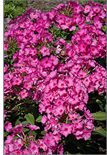
Flame Pink Garden Phlox flowers

Flame Pink Garden Phlox is recommended for the following landscape applications;