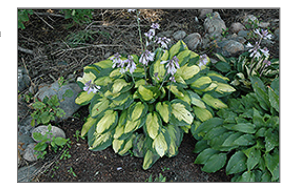
Captain Kirk Hosta in bloom

Captain Kirk Hosta will grow to be about 20 inches tall at maturity extending to 32 inches tall with the flowers, with a spread of 30 inches. When grown in masses or used as a bedding plant, individual plants should be spaced approximately 26 inches apart. Its foliage tends to remain dense right to the ground, not requiring facer plants in front. It grows at a medium rate, and under ideal conditions can be expected to live for approximately 10 years. As an herbaceous perennial, this plant will usually die back to the crown each winter, and will regrow from the base each spring. Be careful not to disturb the crown in late winter when it may not be readily seen!