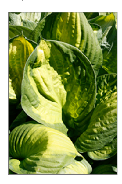
Captain Kirk Hosta foliage

2079 Carp Road Ottawa, Ontario, Canada K2S 1B9 Telephone: +1 613 836 6880