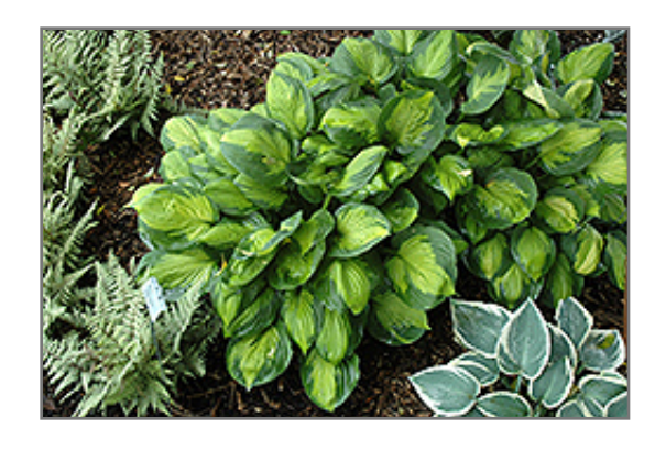
Captain Kirk Hosta

Captain Kirk Hosta is a dense herbaceous perennial with tall flower stalks held atop a low mound of foliage. Its relatively coarse texture can be used to stand it apart from other garden plants with finer foliage.