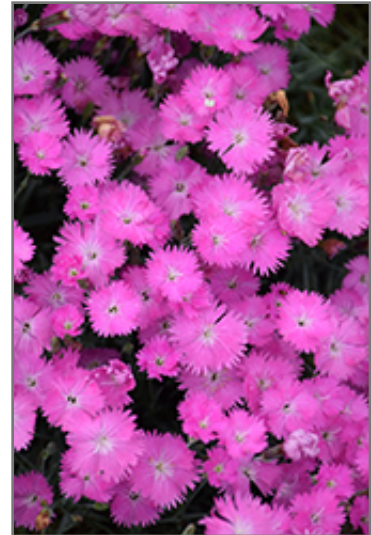
Firewitch Pinks flowers

This plant will require occasional maintenance and upkeep, and is best cleaned up in early spring before it resumes active growth for the season. It is a good choice for attracting bees and butterflies to your yard, but is not particularly attractive to deer who tend to leave it alone in favor of tastier treats. It has no significant negative characteristics.