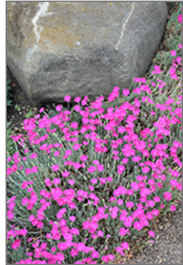
Firewitch Pinks in bloom

Firewitch Pinks is a fine choice for the garden, but it is also a good selection for planting in outdoor pots and containers. It is often used as a 'filler' in the 'spiller-thriller-filler' container combination, providing a mass of flowers and foliage against which the thriller plants stand out. Note that when growing plants in outdoor containers and baskets, they may require more frequent waterings than they would in the yard or garden. Be aware that in our climate, most plants cannot be expected to survive the winter if left in containers outdoors, and this plant is no exception. Contact our experts for more information on how to protect it over the winter months.