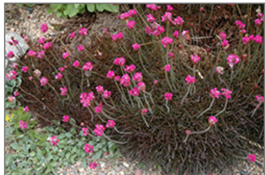
Red-leaved Sea Thrift in bloom