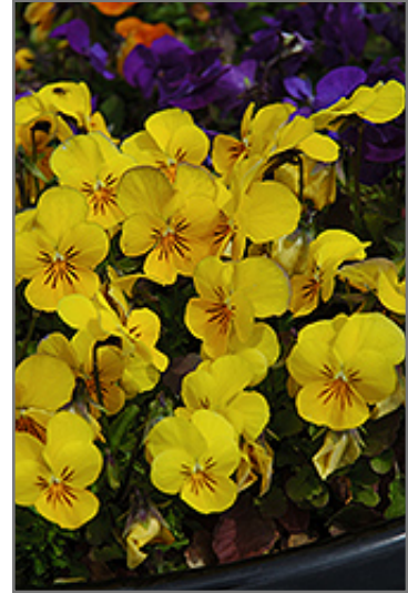
Penny Yellow Pansy flowers

Penny Yellow Pansy is an herbaceous perennial with a mounded form. Its relatively fine texture sets it apart from other garden plants with less refined foliage.