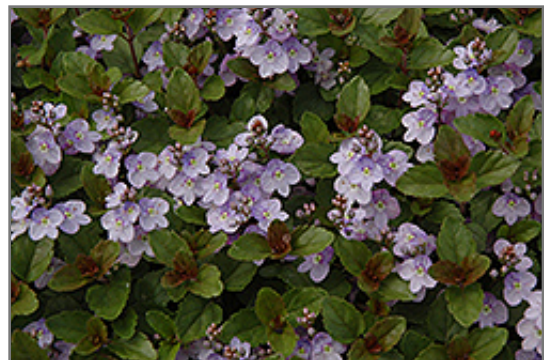
Waterperry Blue Speedwell flowers