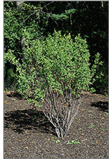
Rainbow Pillar Serviceberry

Rainbow Pillar Serviceberry is a dense multi-stemmed deciduous shrub with a narrowly upright and columnar growth habit. Its relatively fine texture sets it apart from other landscape plants with less refined foliage.