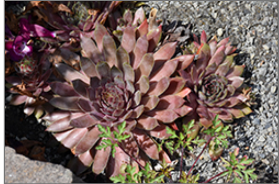
Kalinda Hens And Chicks

Kalinda Hens And Chicks is a dense herbaceous perennial with tall flower stalks held atop a low mound of foliage. Its relatively fine texture sets it apart from other garden plants with less refined foliage.