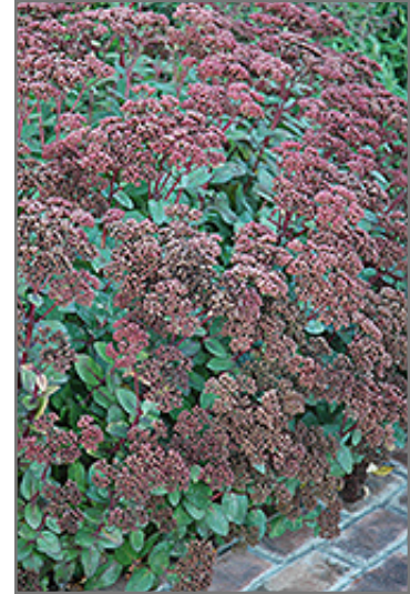
Matrona Stonecrop flowers

Matrona Stonecrop is recommended for the following landscape applications;