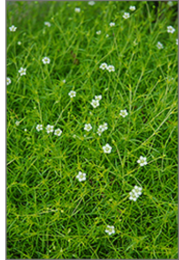
Scotch Moss flowers