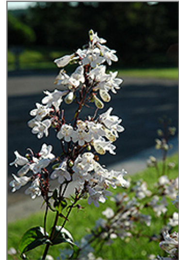
Husker Red Beard Tongue flowers

Husker Red Beard Tongue is recommended for the following landscape applications;