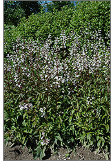
Husker Red Beard Tongue in bloom

Husker Red Beard Tongue is a fine choice for the garden, but it is also a good selection for planting in outdoor pots and containers. With its upright habit of growth, it is best suited for use as a 'thriller' in the 'spiller-thriller-filler' container combination; plant it near the center of the pot, surrounded by smaller plants and those that spill over the edges. Note that when growing plants in outdoor containers and baskets, they may require more frequent waterings than they would in the yard or garden. Be aware that in our climate, most plants cannot be expected to survive the winter if left in containers outdoors, and this plant is no exception. Contact our experts for more information on how to protect it over the winter months.