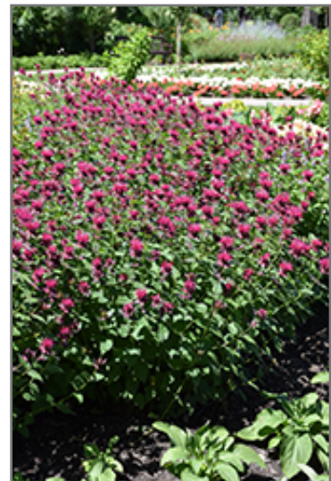
Raspberry Wine Beebalm in bloom