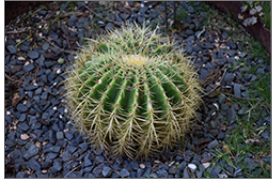
Golden Barrel Cactus

Golden Barrel Cactus is a succulent evergreen plant. It is a member of the cactus family, which are grown primarily for their characteristic shapes, their interesting features and textures, and their high tolerance for hot, dry growing environments. Like all cacti, it doesn't actually have leaves, but rather modified succulent stems that comprise the bulk of the plant, and which are designed to hold water for long periods of time. This particular cactus is valued for its distinctive barrel shape, and usually grows as a single spiny ribbed green stem. This plant has yellow cup-shaped flowers held atop the stems from late spring to early summer, which are interesting on close inspection.