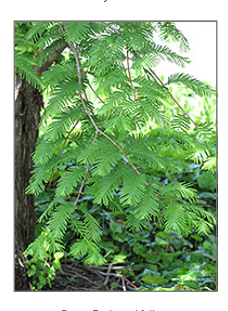
Dawn Redwood foliage