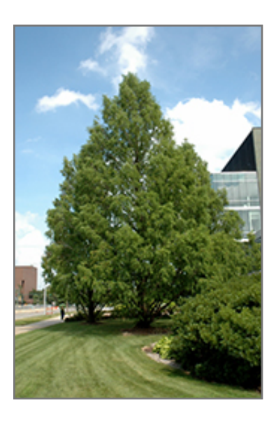
Dawn Redwood