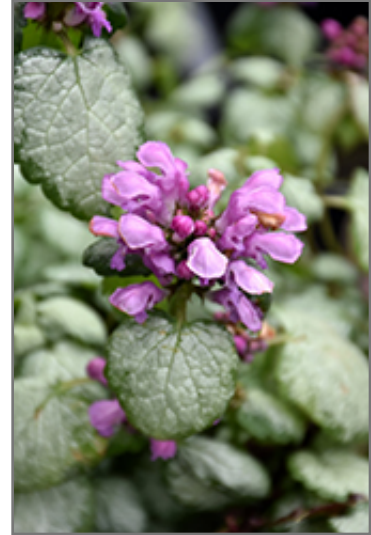
Red Nancy Spotted Dead Nettle flowers