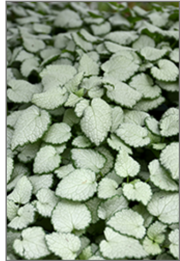
Red Nancy Spotted Dead Nettle foliage

Red Nancy Spotted Dead Nettle is a fine choice for the garden, but it is also a good selection for planting in outdoor pots and containers. Because of its spreading habit of growth, it is ideally suited for use as a 'spiller' in the 'spiller-thriller-filler' container combination; plant it near the edges where it can spill gracefully over the pot. Note that when growing plants in outdoor containers and baskets, they may require more frequent waterings than they would in the yard or garden. Be aware that in our climate, most plants cannot be expected to survive the winter if left in containers outdoors, and this plant is no exception. Contact our experts for more information on how to protect it over the winter months.