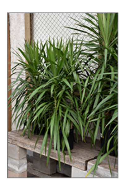
Tarzan Dracaena

When grown indoors, Tarzan Dracaena can be expected to grow to be about 5 feet tall at maturity, with a spread of 24 inches. It grows at a medium rate, and under ideal conditions can be expected to live for approximately 10 years. This houseplant performs well in both bright or indirect sunlight and strong artificial light, and can therefore be situated in almost any well-lit room or location. It does best in average to evenly moist soil, but will not tolerate standing water. The surface of the soil shouldn't be allowed to dry out completely, and so you should expect to water this plant once and possibly even twice each week. Be aware that your particular watering schedule may vary depending on its location in the room, the pot size, plant size and other conditions; if in doubt, ask one of our experts in the store for advice. It is not particular as to soil type or pH; an average potting soil should work just fine.