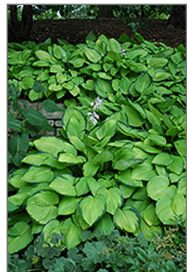
Gold Standard Hosta in bloom