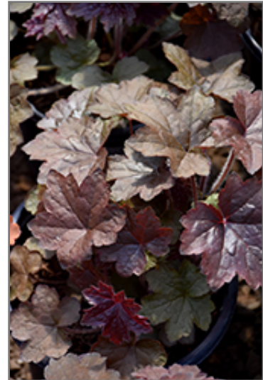
Palace Purple Coral Bells foliage

Palace Purple Coral Bells is recommended for the following landscape applications;