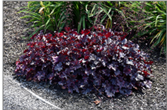
Plum Pudding Coral Bells