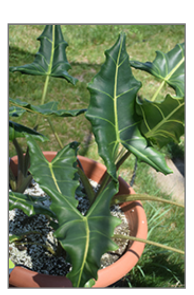
Sarian African Mask foliage

When grown indoors, Sarian African Mask can be expected to grow to be about 6 feet tall at maturity, with a spread of 4 feet. It grows at a medium rate, and under ideal conditions can be expected to live for approximately 5 years. This houseplant will do well in a location that gets either direct or indirect sunlight, although it will usually require a more brightly-lit environment than what artificial indoor lighting alone can provide. It is quite adaptable, prefering to grow in average to wet conditions, and will even tolerate some standing water. The surface of the soil should be kept consistently moist all of the time, and you should expect to water this plant two or more times each week, especially if it's growing in a low-humidity environment. Be aware that your particular watering schedule may vary depending on its location in the room, the pot size, plant size and other conditions; if in doubt, ask one of our experts in the store for advice. It is not particular as to soil type or pH; an average potting soil should work just fine. Be warned that parts of this plant are known to be toxic to humans and animals, so special care should be exercised if growing it around children and pets.