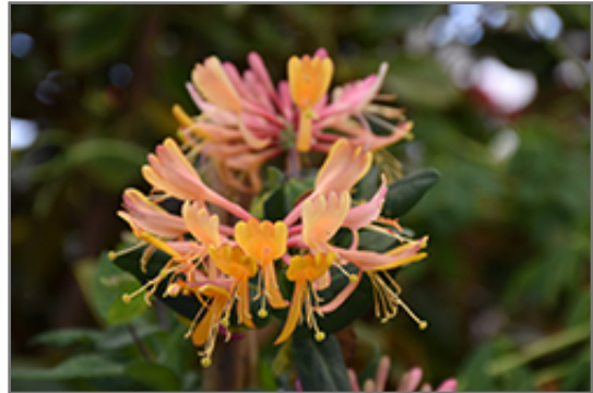
Goldflame Honeysuckle flowers

Goldflame Honeysuckle is recommended for the following landscape applications;