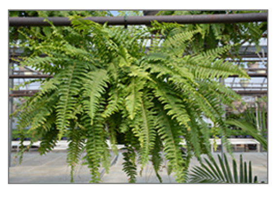
Boston Fern

This is a dense herbaceous evergreen houseplant with a shapely form and gracefully arching foliage. Its relatively fine texture sets it apart from other indoor plants with less refined foliage. This plant should not require much pruning, except when necessary to keep it looking its best.