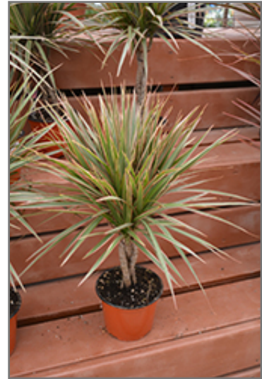
Colorama Dracaena in full

This is an herbaceous evergreen houseplant with an upright spreading habit of growth. Its relatively coarse texture stands it apart from other indoor plants with finer foliage. This plant may benefit from an occasional pruning to look its best.