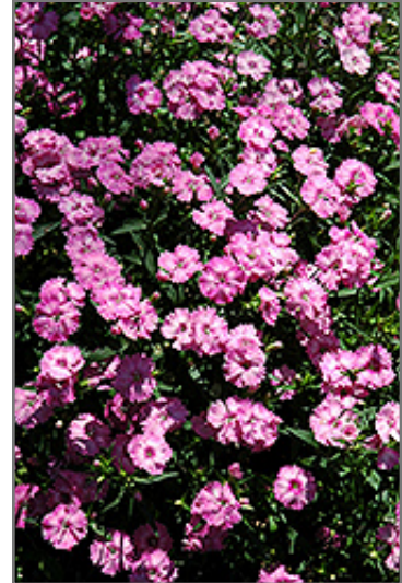
Blue Hills Pinks flowers

This is a relatively low maintenance plant, and is best cleaned up in early spring before it resumes active growth for the season. It is a good choice for attracting bees and butterflies to your yard, but is not particularly attractive to deer who tend to leave it alone in favor of tastier treats. It has no significant negative characteristics.