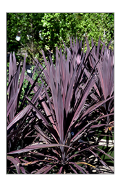
Bauer's Cordyline

When grown indoors, Bauer's Cordyline can be expected to grow to be about 6 feet tall at maturity, with a spread of 3 feet. It grows at a medium rate, and under ideal conditions can be expected to live for approximately 10 years. This houseplant will do well in a location that gets either direct or indirect sunlight, although it will usually require a more brightly-lit environment than what artificial indoor lighting alone can provide. It does best in average to evenly moist soil, but will not tolerate standing water. The surface of the soil shouldn't be allowed to dry out completely, and so you should expect to water this plant once and possibly even twice each week. Be aware that your particular watering schedule may vary depending on its location in the room, the pot size, plant size and other conditions; if in doubt, ask one of our experts in the store for advice. It is not particular as to soil type or pH; an average potting soil should work just fine.