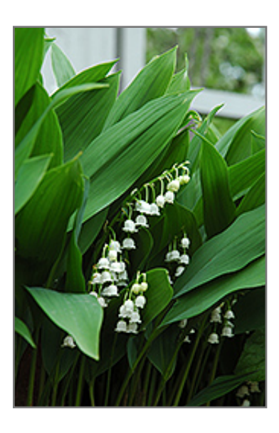
Lily-Of-The-Valley flowers

When grown indoors, Lily-Of-The-Valley can be expected to grow to be about 8 inches tall at maturity, with a spread of 24 inches. It grows at a medium rate, and under ideal conditions can be expected to live for approximately 10 years. This houseplant performs well in both bright or indirect sunlight and strong artificial light, and can therefore be situated in almost any well-lit room or location. It prefers to grow in average to moist soil. The surface of the soil shouldn't be allowed to dry out completely, and so you should expect to water this plant once and possibly even twice each week. Be aware that your particular watering schedule may vary depending on its location in the room, the pot size, plant size and other conditions; if in doubt, ask one of our experts in the store for advice. It is not particular as to soil type or pH; an average potting soil should work just fine. Be warned that parts of this plant are known to be toxic to humans and animals, so special care should be exercised if growing it around children and pets.