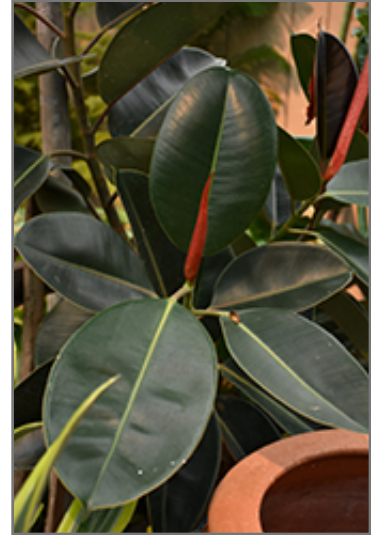
Rubber Tree foliage

This is a multi-stemmed evergreen houseplant with a more or less rounded form. This plant may benefit from an occasional pruning to look its best.